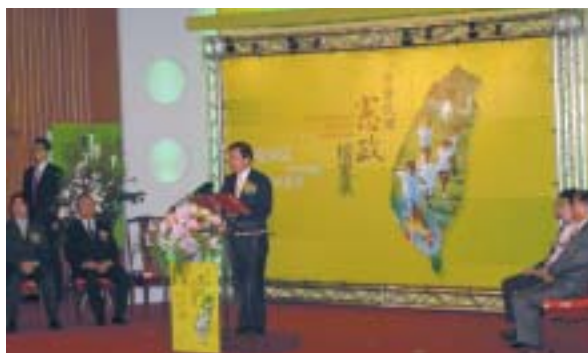
President Chen Shui-bian speaks at the May 19 opening ceremony of the Constitutional Archives Exhibition

The southern Taiwan exhibition is scheduled to be held in July at the Kaohsiung Museum of History, and the central Taiwan show will be held in September at the Wen Ying Hall of the Taichung City Cultural Affairs Bureau. For more information please visit the NAA website at: http://www.archives.gov.tw .